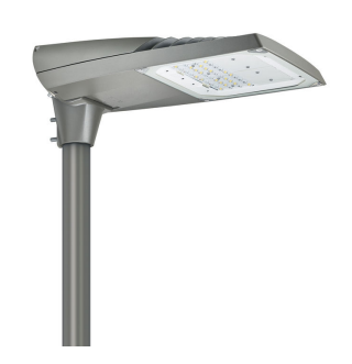
Luma gen2 medium Solar